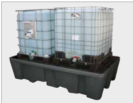
IBC bund 1100/2 PE with PE perforated plates