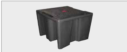
IBC bund 1100/1 PE with PE perforated plates