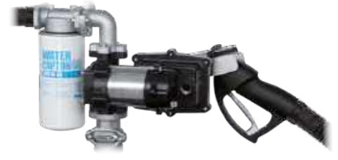
EX50 DRUM WITH AUTOMATIC NOZZLE

OUR PUMPS COMPLIES WITH THE FOLLOWING MARKING ATEX/IECEx