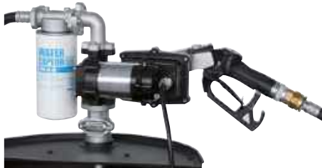
EX50 DRUM WITH AUTOMATIC NOZZLE