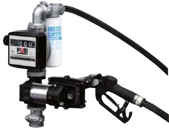
PIUSI EX50 DRUM WITH METER AND FILTER

The PIUSI EX50 DRUM is a complete pump transfer kit expressly engineered for ATEX/IECEx areas. This system is composed of a high-efficiency pump, manual or automatic nozzle and a telescopic suction hose. Thanks to the flanged components, this transfer set allows users to replace any component without using sealants thus creating maximum versatility and adaptability to any kind of condition. K33 mechanical meter available on request.