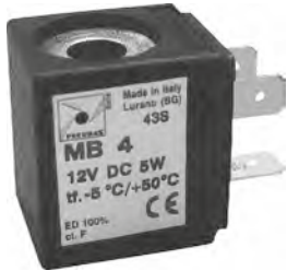
Weight 54 gr.