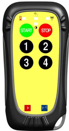
PART NUMBER SE201PXX.SIS-SE021