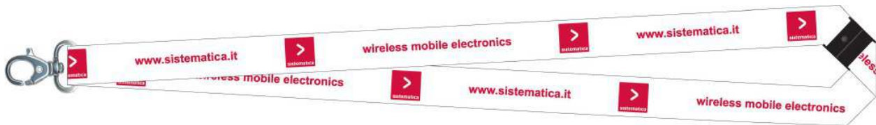
PART NUMBER MECCOLLSER2