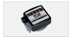
K33 MECHANICAL METER