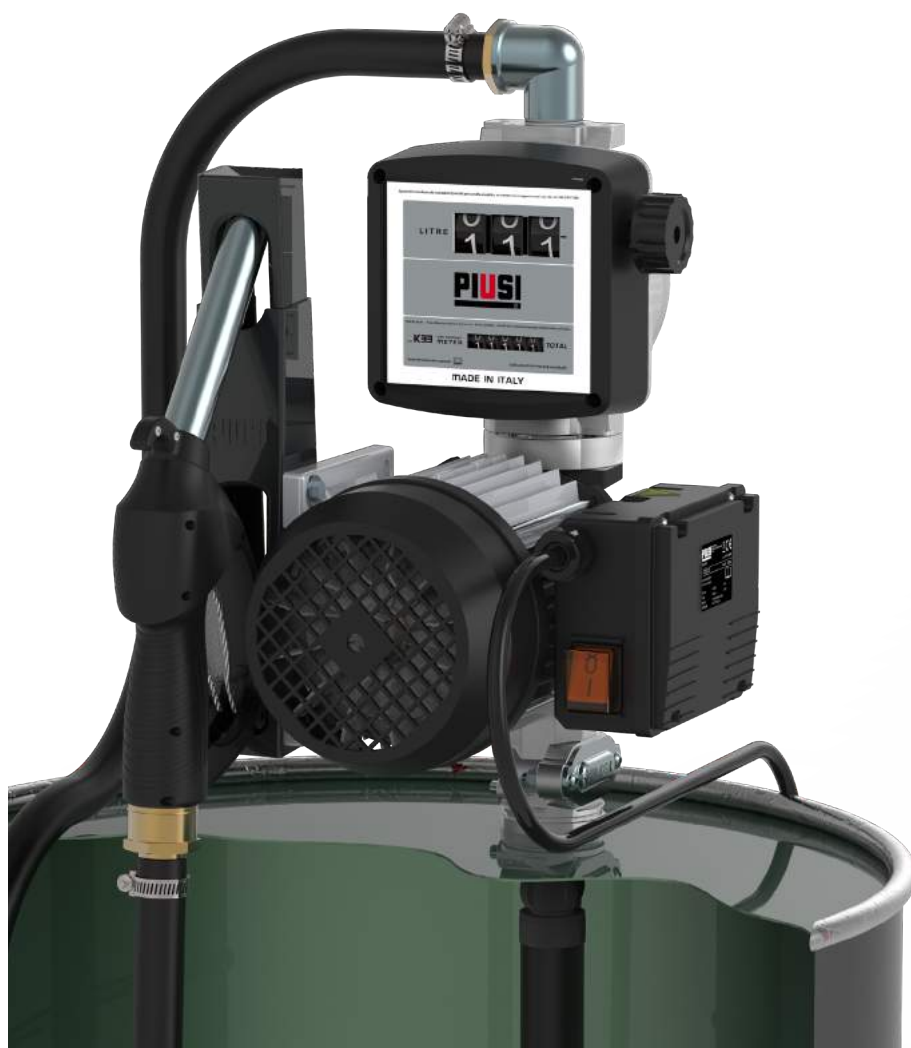
DRUM VISCOMAT VANE