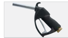
SELF3000 MANUAL NOZZLE